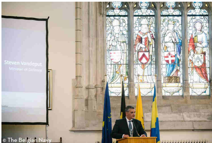
Closing address by Mr Steven Vandeput, Minister of Defence